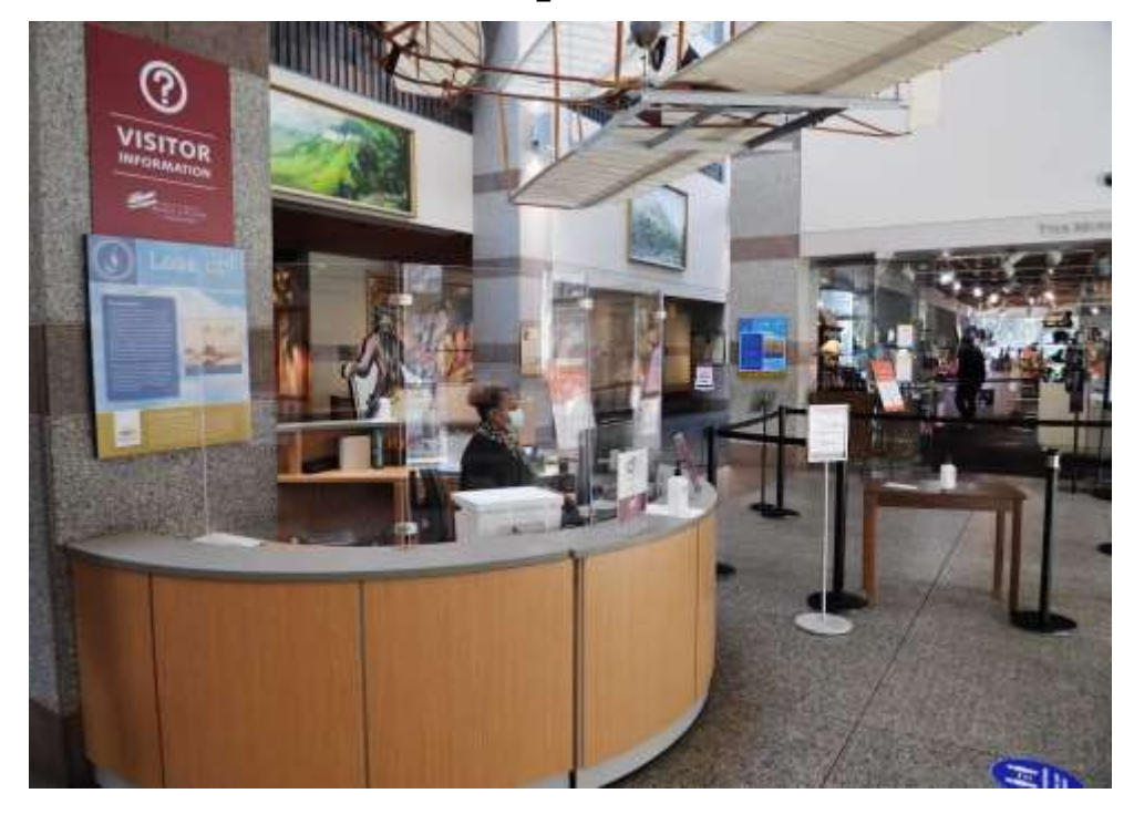
You can find information about accessibility at the NCMH here. If we need a wheelchair, we can ask the Information Desk.

Once we get inside, we'll see the Information Desk. We can ask questions there.