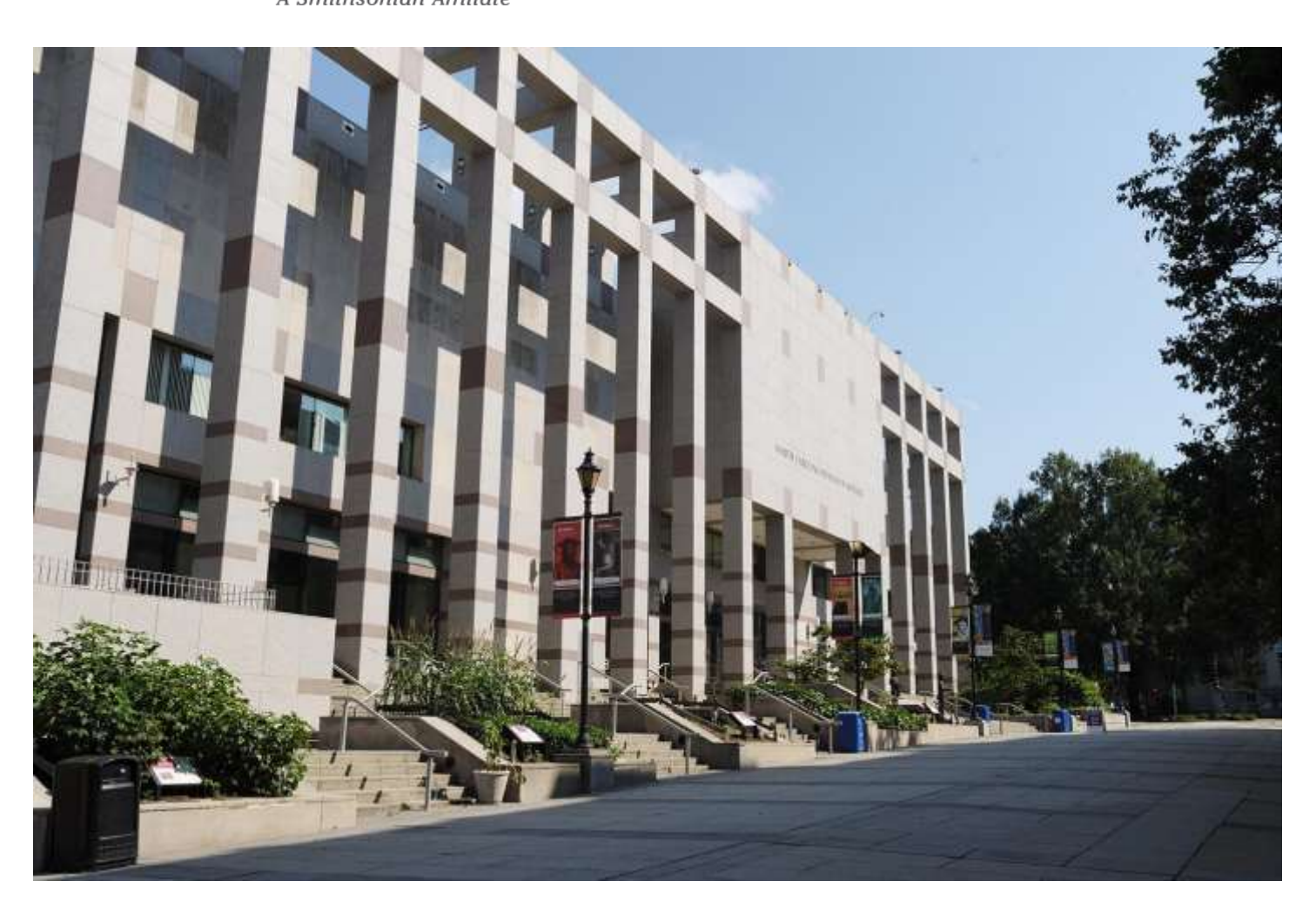
Take a look at what you'll see when you visit the North Carolina Museum of History!