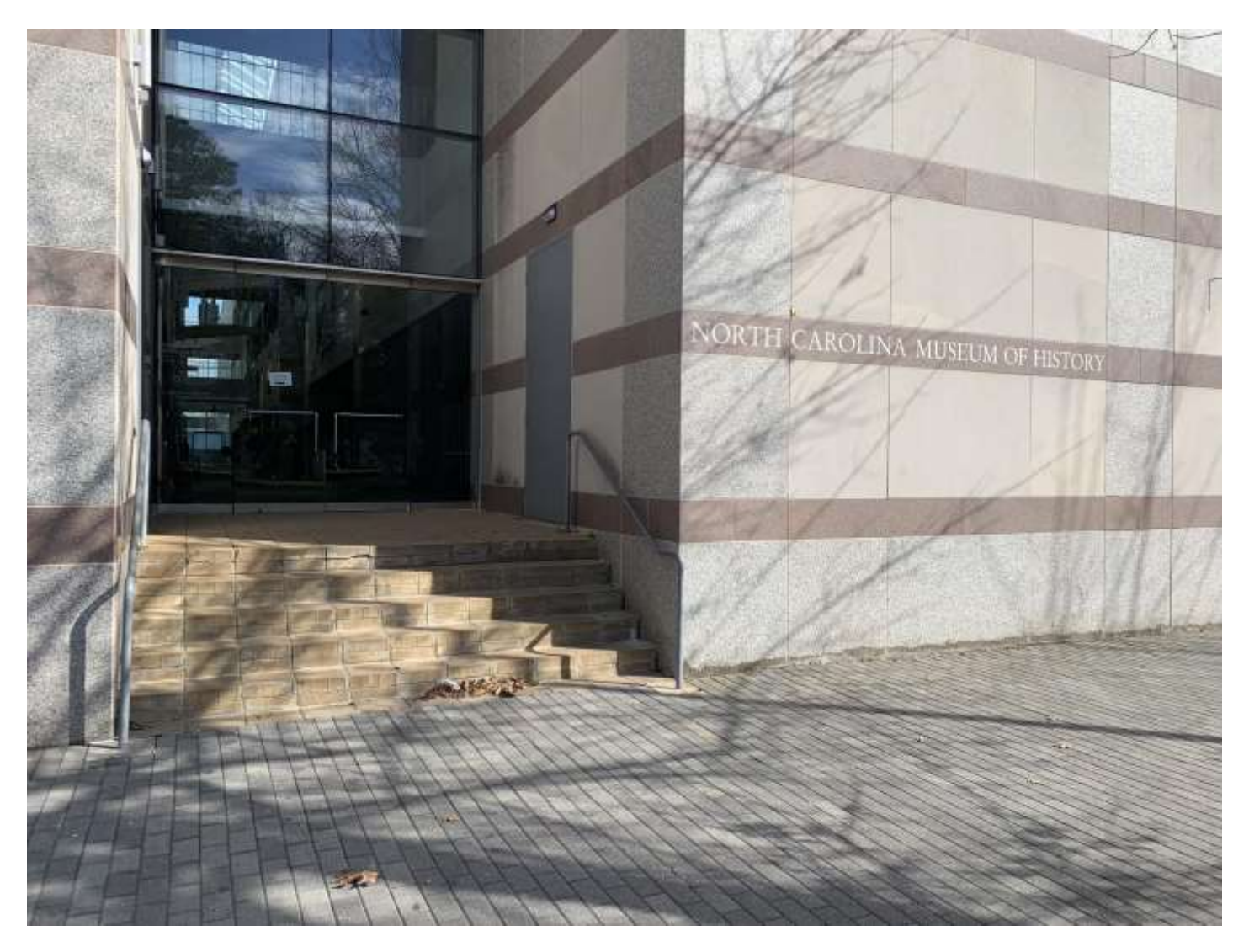
There are two entrances to the museum.

Depending on where we park, it might take us a couple of minutes to walk up to the building. We may have to cross a street, but there are crosswalks and sidewalks.