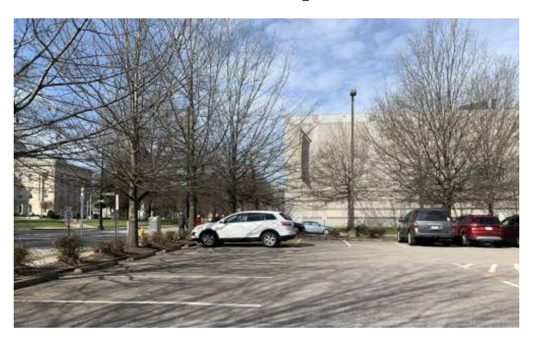
For more information about drop off, arrival and parking at the NC History Museum, please use this link.

If we travel to the NCMoH by car, we will need to find parking. Parking lots and street parking are available, both with ADA accessible spots.